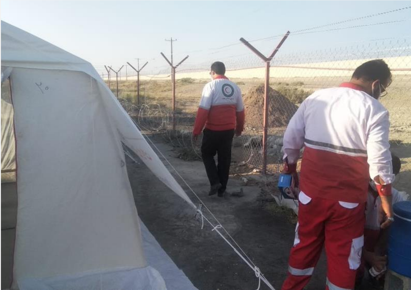
The IRCS providing drinking water at a zero border transit shelter in Sistan-Baluchestan.

In accordance with the IRCS contingency plan, the Operational Strategy was adapted and will now support the procurement of water tanks as well as some water distribution points in camps as needed.