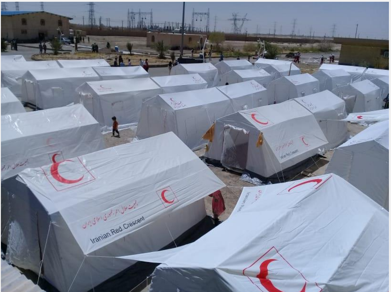
IRCS providing shelter support at zero borders.