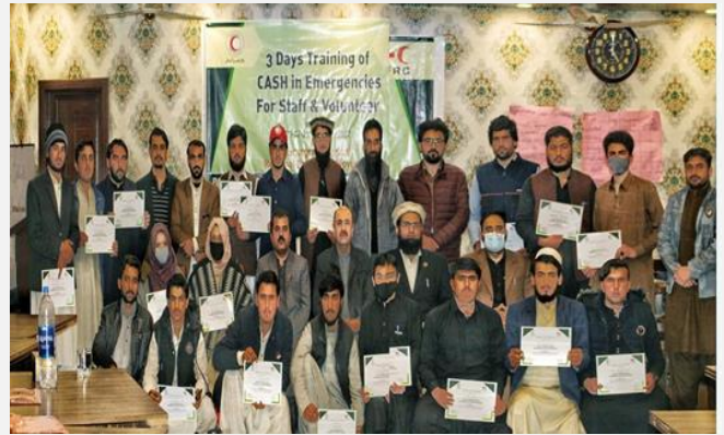
The PRCS conducted three days of training for staff and volunteers in Quetta, Balochistan on CASH in emergencies.