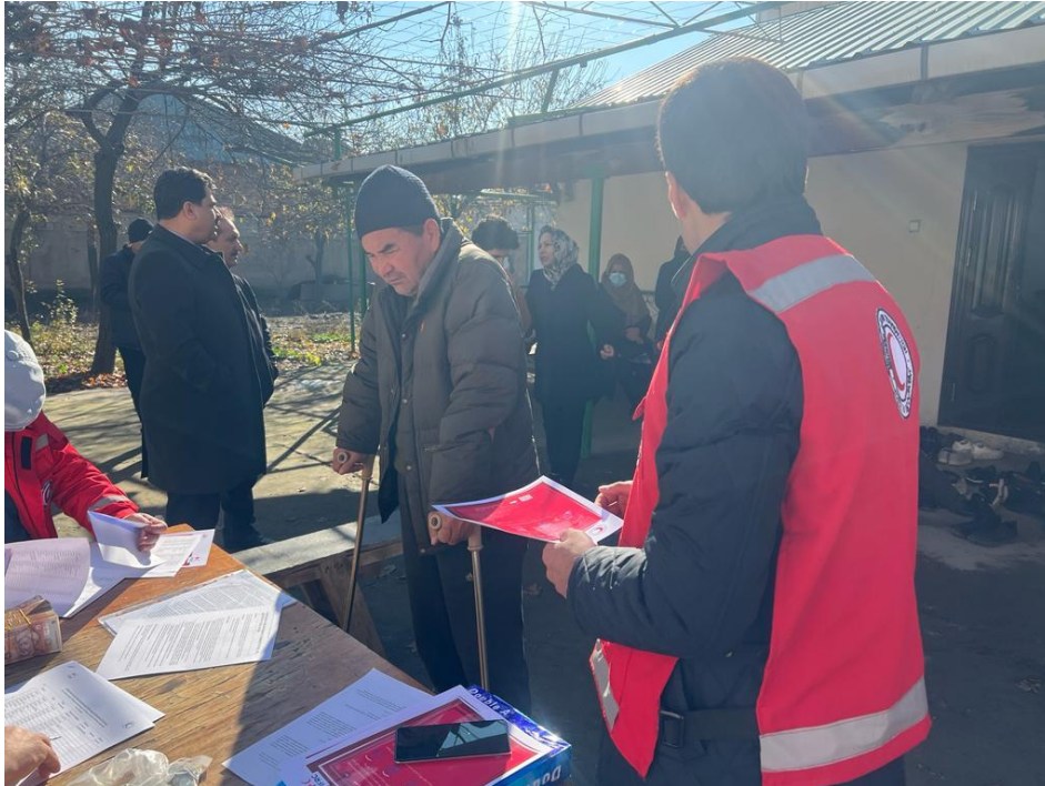
Cash distribution to Afghan refugees.