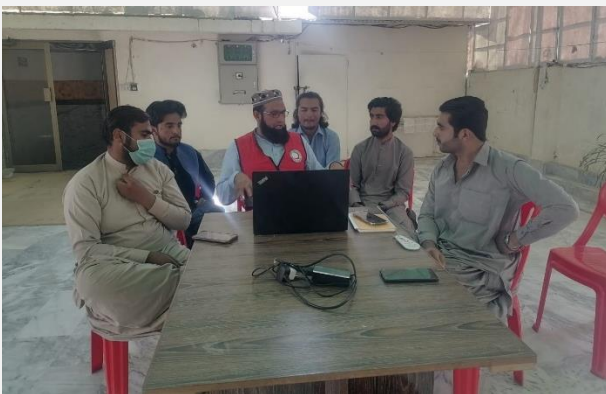
Volunteer orientation on the cash registration and disbursement process.