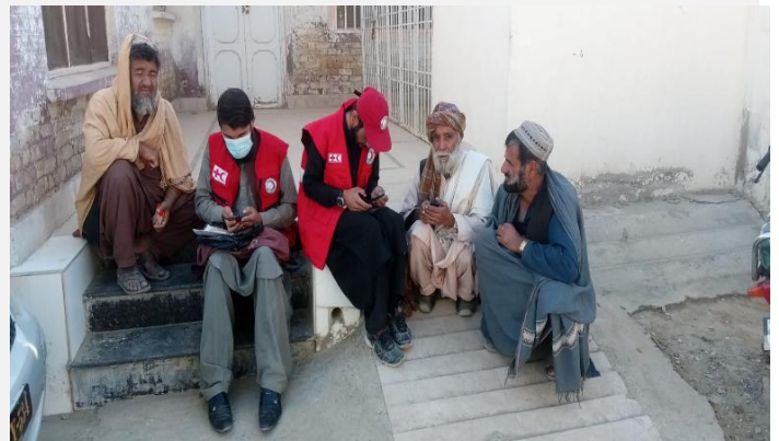
PRCS volunteers register targets for cash distributions.