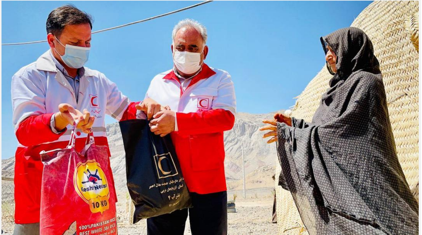
IRCS staff distributing food items.

Food packages were delivered to 3,120 households for the first 72 hours based on the emergency needs of migrants. Furthermore, due to the rising cost of basic commodities and the displacement of migrants into urban areas, the Movement Preparedness and Response Plan is focused on the provision of food and hygiene kits rather than relief tents. The emergency tents will only be available to migrants at zero border crossing points.