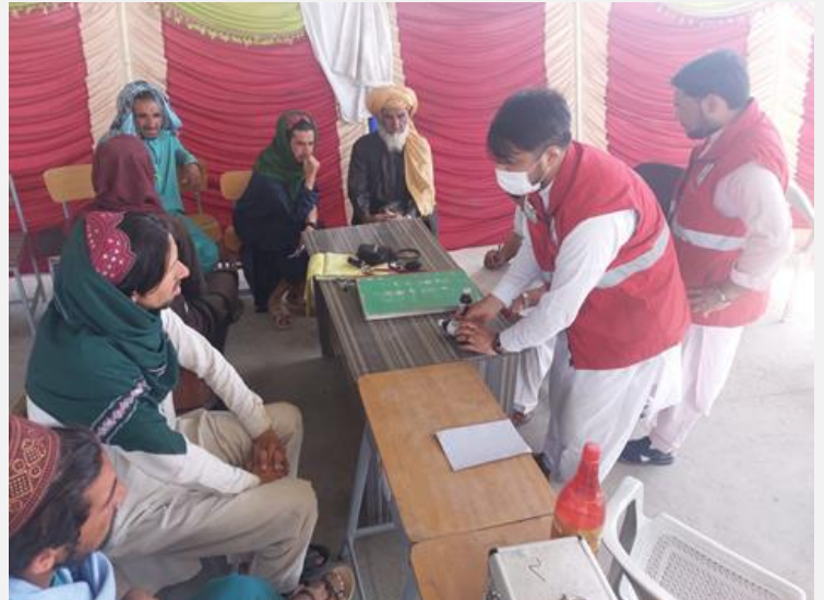
Patients waiting their turn at the MHU in Waziristan district.