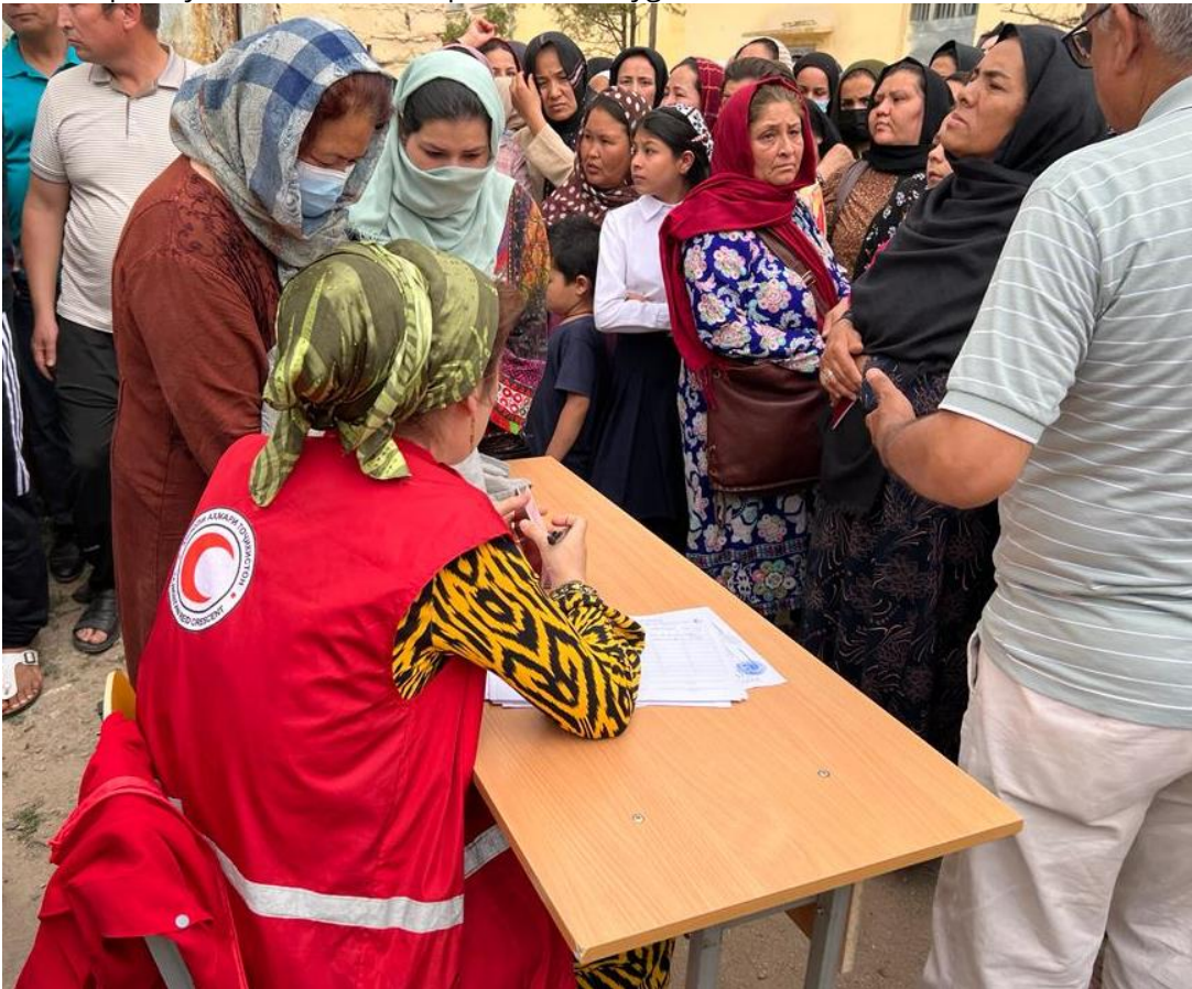
The RCST registering impacted people in Vahdat for distribution of hygiene kits.