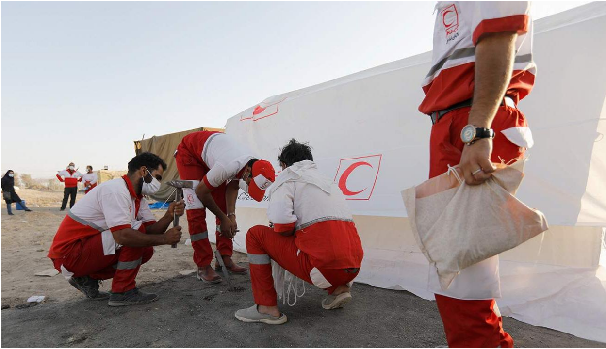
Emergency shelter assistance being provided to Afghan migrants.

The IRCS has provided emergency assistance (relief items) to new Afghan arrivals in the eastern provinces, including tents (15,128 units), mats (7,700 pieces), blankets (9,040 pieces), heaters (8,500 pieces), kitchenware (4,000 sets), 72-hour food packages (2,000 packs), and one-month food packages (1,200 packs). From August onwards, the IRCS, in coordination with engaged stakeholders, began preparing for the anticipated influx. All of those who managed to enter, spreading throughout Iran, did so illegally. In response, the Ministry of the Interior conducted a voluntary headcount registering 2.2 million Afghans, extending their stay from October 2022 to 20 January 2023. The Afghans did not go to the camps, preferring instead to stay in host communities. BAFIA and UNHCR have not been able to get exact figures on how many will be going to the planned camps for assistance. With this uncertain scenario, the Movement contingency plan shifted its focus to a preparedness response plan for 2023. The prognosis is that due to the skyrocketing inflation and economic challenges in Iran, the Afghans might not be able to continue to share resources and live in host communities, therefore, the option of camps remains valid. In case of a huge influx, the IRCS must be ready to provide basic assistance in the camps, and this is the reason that the procurement of stocks is underway – to be ready for possible distributions in the future.