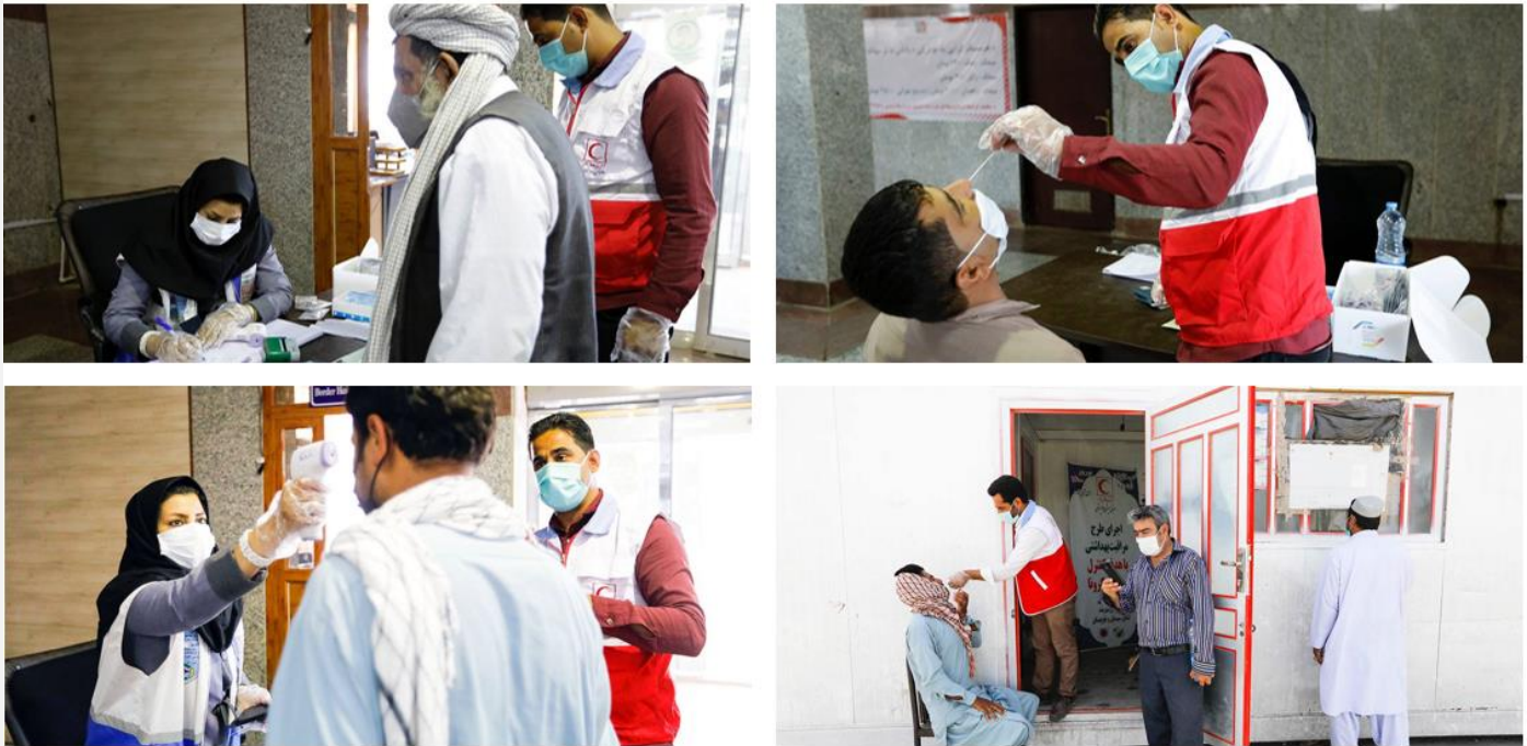
IRCS performing rapid screening tests.