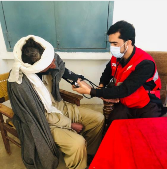
Patients receiving OPD services at the MHU in North Waziristan district.