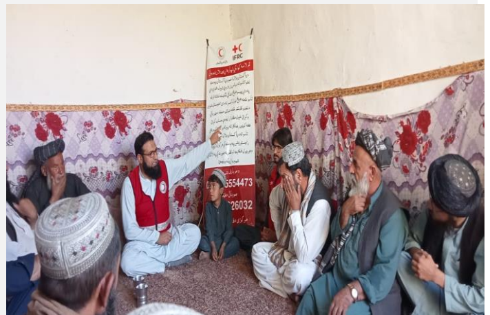
Orientation for the targeted population on the cash disbursement process and CEA mechanisms.