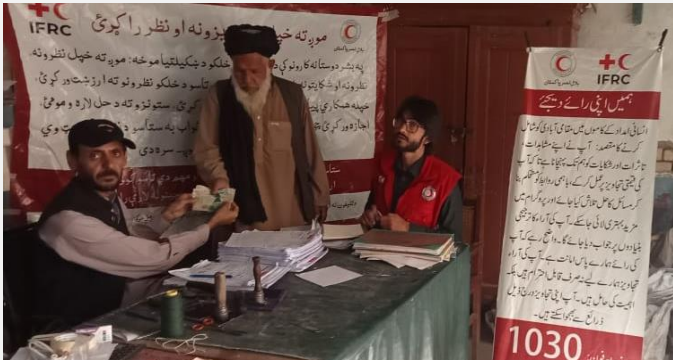
A 1GPO official disbursing cash to selected Afghan nationals in Balochistan. A PRCS volunteer is present to inform and facilitate the process.