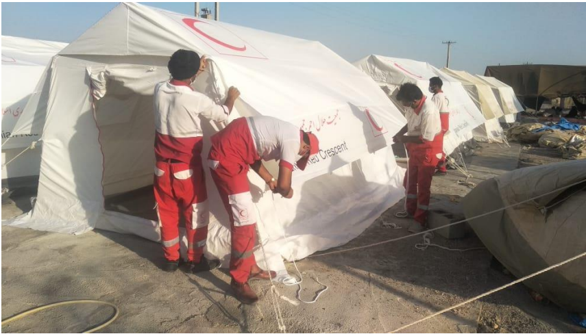
The Iranian Red Crescent Society (IRCS) setting up emergency shelters.

Iran shares a 921-kilometre border with Afghanistan and is home to one of the world's largest refugee populations, primarily Afghans. Access to Iranian territory remains limited to Afghan passport holders with valid visas for Iran, despite unofficial reports that between 500,000 and one million Afghans have crossed into Iran since 2021. An increase in security measures at unofficial border crossing points, as well as the resumption of visa issuance at the Iranian embassy in Kabul, has resulted in a decrease in the proportion of arrivals who reported arriving irregularly and a decrease in the proportion who reported using smugglers to enter. The majority of