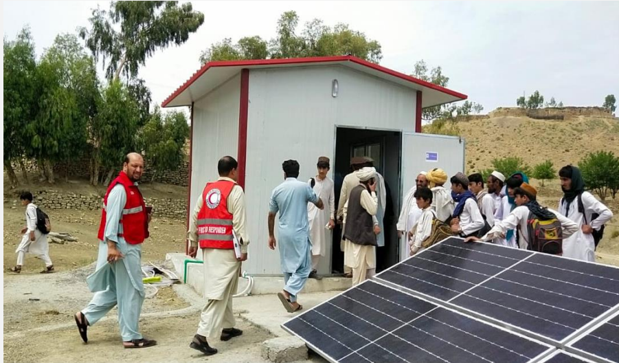
Solar panels at the water filtration plant in North Waziristan district.

At the medical camps in the targeted districts of Chitral, Khyber, and North Waziristan, 26,834 people participated in hygiene promotion activities which covered proper handwashing techniques, personal hygiene, the use of oral rehydration solutions (ORL) for diarrhoea, etc.