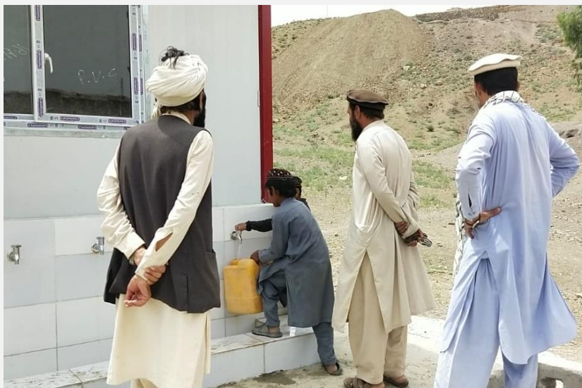
People collecting water from the solar water filtration plant in North Waziristan district.