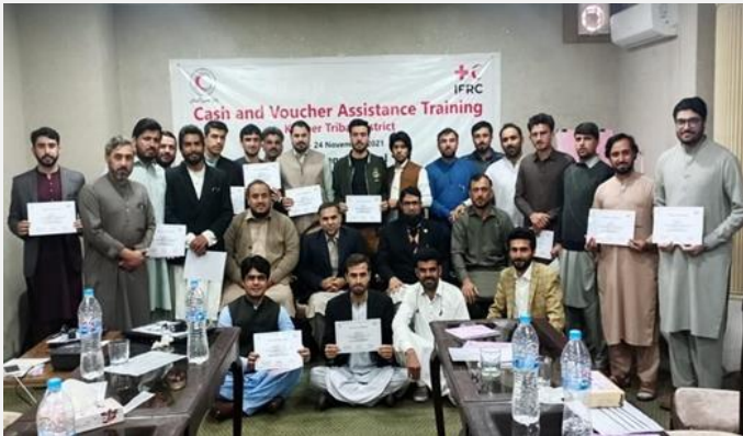
Three-day training for staff and volunteers with PRCS Peshawar on CASH in emergencies.