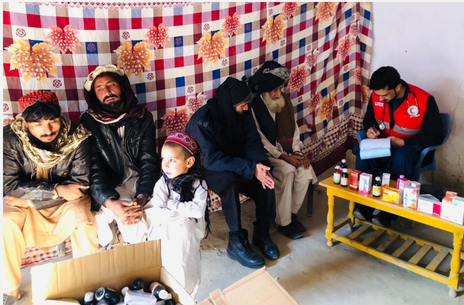
Patients receiving OPD services at the MHU in North Waziristan district.