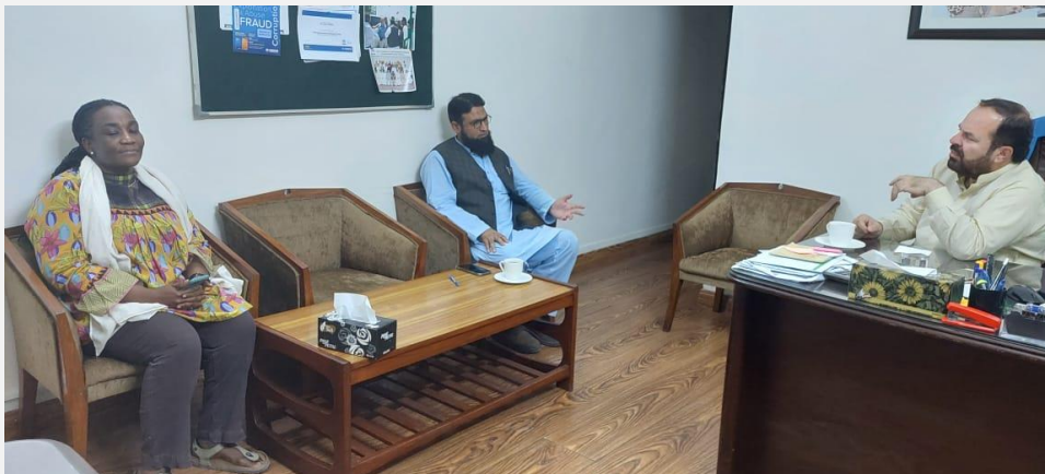
Coordination meeting with the CAR.

Membership partners are closely and regularly coordinating complementarities with programs and operations being implemented in Pakistan. A mechanism is in place through a signed Movement Coordination Agreement (MCA), which fosters effective coordination, collaboration, and information sharing in addition to providing a platform for joint planning and reporting on different operations in the country.